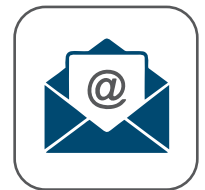
Time spent on e-mails